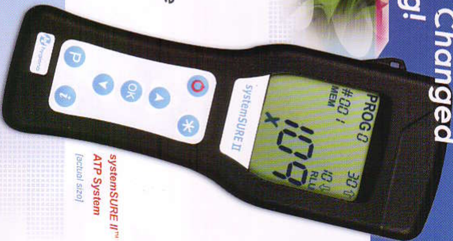
systemSURE II™ ATP System [actual size]